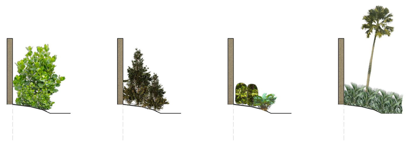
SOUND WALL PLANTING OPTIONS

I-75 FROM SR 822 SHERIDAN TO I-595 CONCEPTUAL LANDSCAPE RENDERINGS FPID NO. 441319-1-52-01